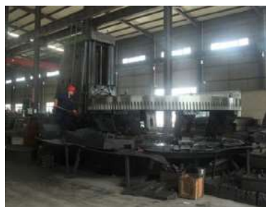
8m hobbing machine