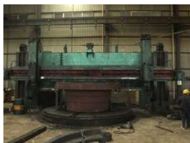
8m vertical lathe