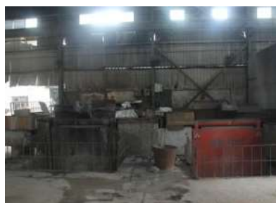
15T medium frequency electric furnace