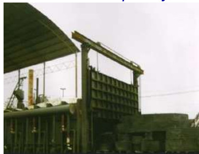
Large annealing kiln